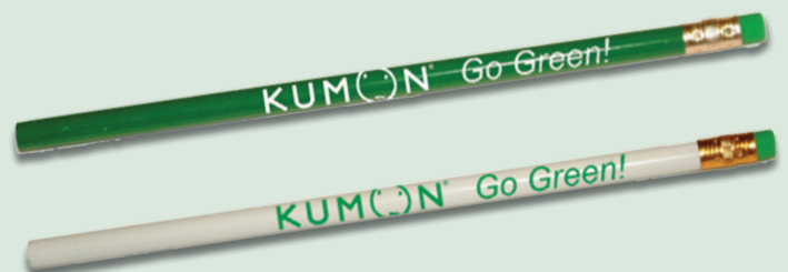
limited-edition "Go Green" pencils